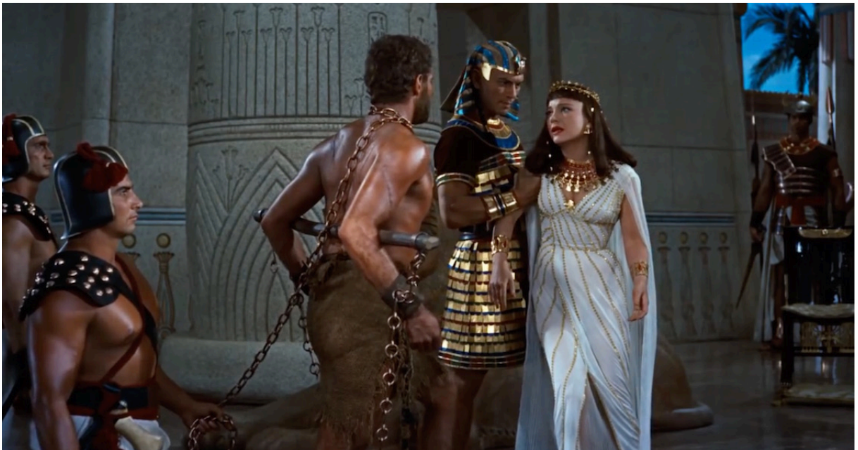
FIG 5. Charlton Heston, Brynner and Anne Baxter in Ten Commandments

any bodily display, was fitting enough for a religious leader. Within this particular scene, visual attention travels towards Brynner's Rameses standing behind Moses, notably shorter and of a smaller frame, dressed in an elaborate, shiny gold-plated skirt, golden armbands and ornate headpiece, his other foot up on stairs for an impression of additional length and authority. Both men stand still with their legs apart, muscles tense, Brynner's motions stiff as he whisks their mutual love-interest Nefertiri (Anne Baxter) aside. This angularity and force of movement, combined with the statuesque stillness and grim facial expression of his erect body, conveys masculine assertiveness and power independent of the make-up, heavy bodily ornament and extravagantly decorated couture.