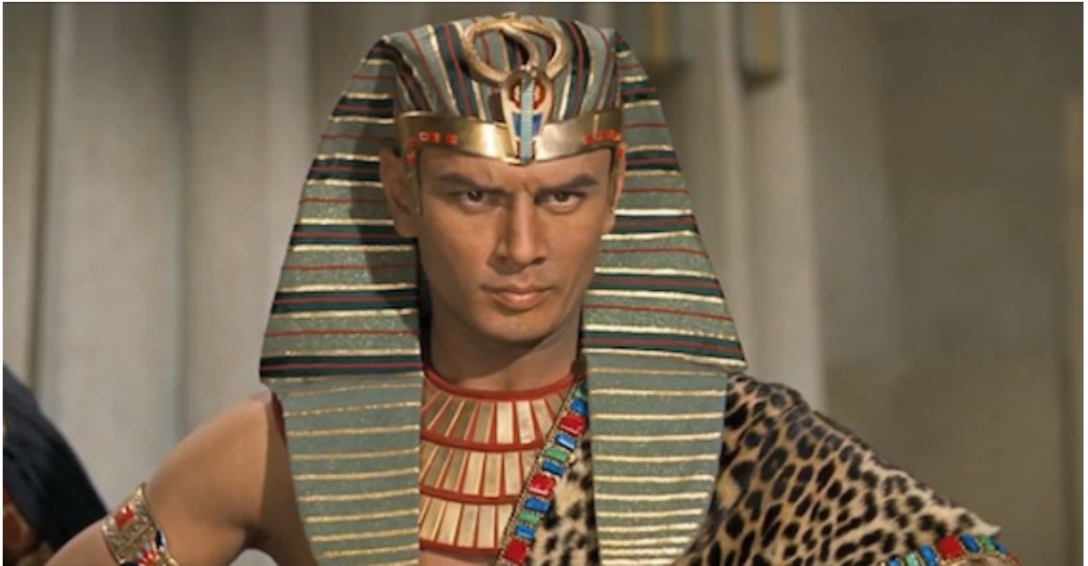
FIG 1. Yul Brynner as Rameses in Ten Commandments (1956)