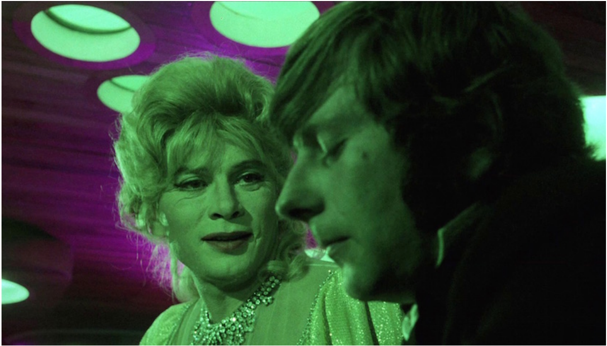
FIG 6. Brynner and Roman Polanski in The Magic Christian (1969)

In 1969, Brynner made a short cameo drag appearance as torch singer in Peter Sellers' The Magic Christian . The scene shows Brynner, glamorously made up, in a blonde wig, large crystal diamanté necklace and a pale yellow silky dress with pointy breasts. This blonde first fixes her eyes on Roman Polanski in a futuristic bar and softly inquires, 'do you want to buy a girl a drink, big boy?' Sipping on her cocktail, still focusing her seductive attention on Polanski ('here's to looking at you, mister') and gently stroking him with a gloved hand, she then moves into a brief yet highly emotional rendition of Mad About the Boy . As the song swells, she moves around the bar before lifting her hand to forehead in a final, studied gesture of despair. The singer's dramatically pained expression suddenly stills into a macho stare as she tugs off her wig, and the adoring eyes of the men around her shift into expressions of horror, witnessing the baldness beneath. One of the men exclaims, 'oh, no!', and as the singer replies with 'oh, yes', it is clear that the actress Miriam Karlin's sound work has been replaced by Brynner's own recognizable, low voice: end of cameo.