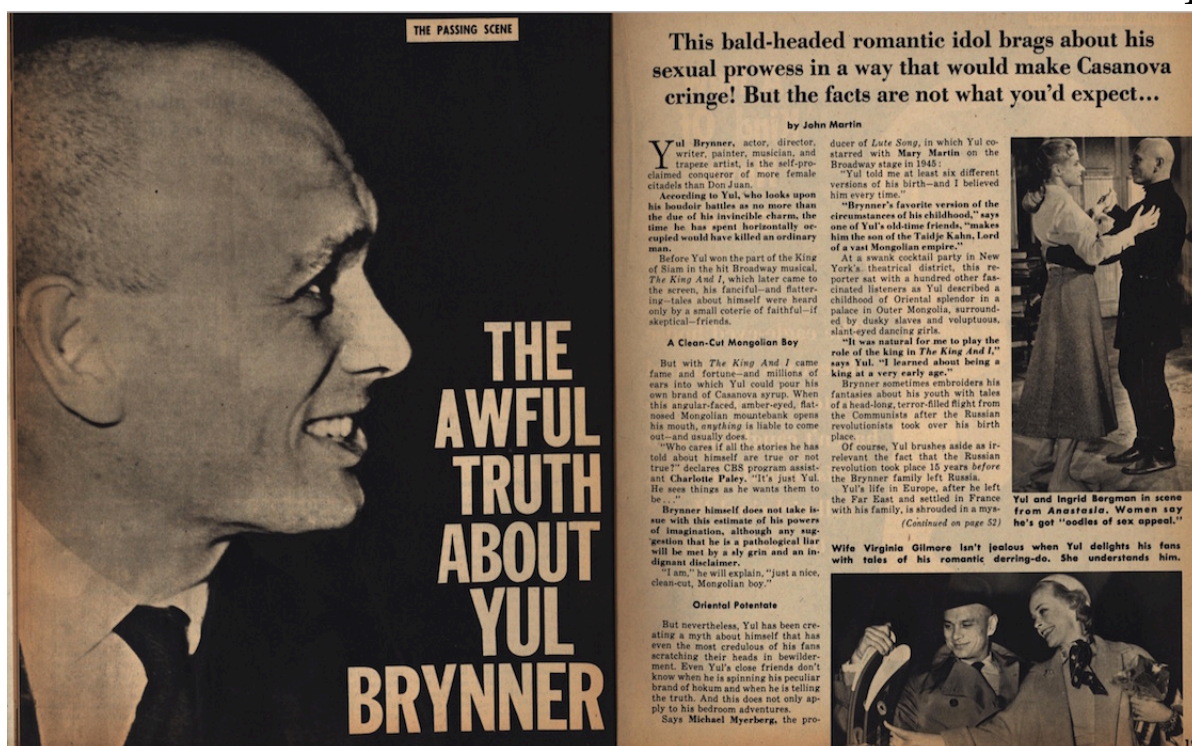
FIG 3. Behind the Scenes exposé (1957)

Brynner's star image was charged with physical energy, animal insatiability and carnal appetite also well beyond the sexual. A Redbook article following the release of The King and I addressed his gastronomic habits in fascinated, incredulous tones: 'This is the fabulous Yul Brynner ... who is being widely hailed as the most exciting male on the screen since Rudolph Valentino. (...) His breakfast consists of a large steak, sometimes two, washed down with coffee. Before nine o'clock, tigerish hunger smites him again and he tides himself over until 12 o'clock lunch with a few large meat sandwiches. For lunch he has chops, steak, turkey, or roast beef and this may get him by until two o'clock when he sends out for sandwiches and cake.' 23 Excess and penchant for bodily pleasure, in short, never loomed far away in the construction of Yul Brynner's fantastic figure.