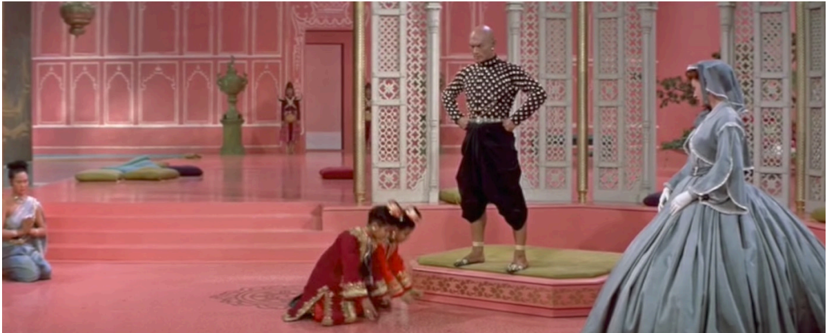
FIG 4. Brynner's signature pose in The King and I (1956)

If, following Straw, the film extra functions as 'graphic detail or as expressive human body', 36 then a lead actor would be the embodied cinematic centrepiece and highlight. As background, extras and supporting actors afford stars with much of their extraordinary presence onscreen. 37 The issue is one of 'scales of presence' where extras, as filmic ornament, become dissolved 'within a film's broader organization of graphic lines and shapes' as 'part of the rippling of graphic information outwards from a scene's central characters'. 38 In contrast, Brynner's frequently exposed and lavishly adorned body was showcased as a spectacle, or at least as a noteworthy sight, towards which attention meanders and upon which it fixates. His bodily presence dominated scenes in an independently spectacular vein.